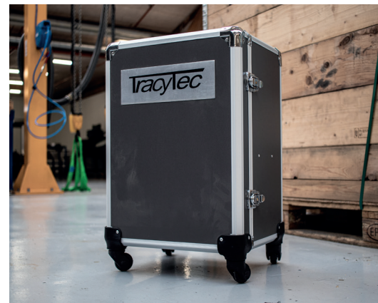
The TTW-610 is delivered in a high quality case.

You deposit what you need and nothing more, then you can often refurbish without need of machining.